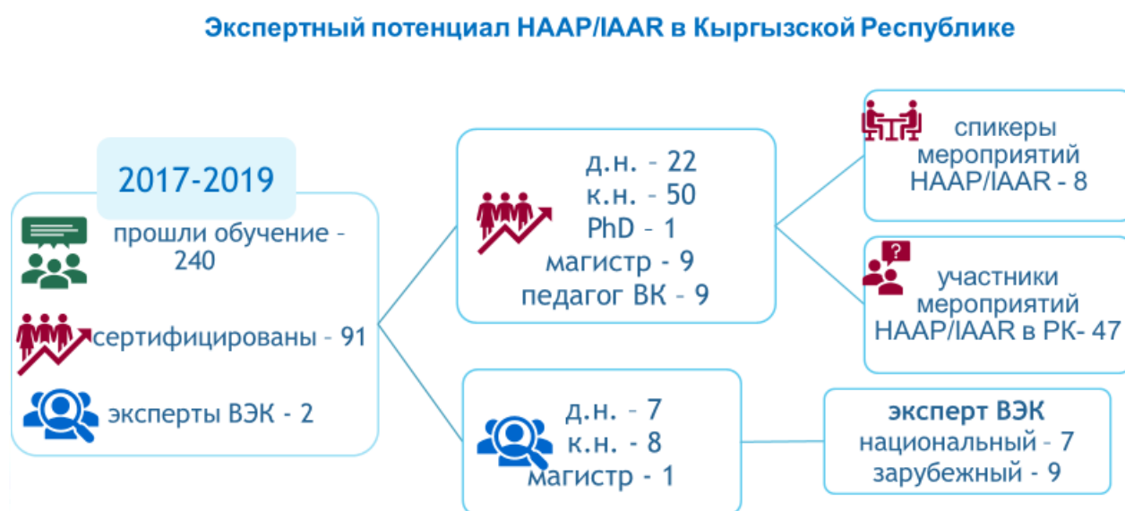
Figure 3. Activity of IAAR experts, representatives of EO of Kyrgyzstan

the teaching staff of universities of Kyrgyzstan were trained through a series of IAAR training seminars, of which 91 were certified, 82 of which were teachers of national and state universities, 9 were non-state universities. The number of experts is shown in figure 3.