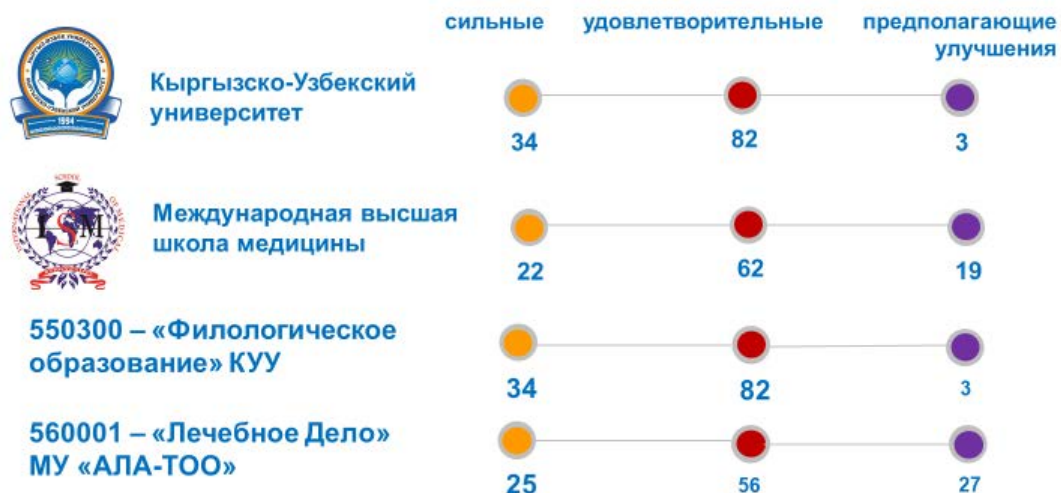
Figure 1. EO/EP quality compliance matrix for standards criteria of institutional accreditation.

When analyzing the final materials of the independent assessment in the conclusions of the expert commissions, coincidences in the EP of the compliance of some indicators with the criteria of the program accreditation standards were revealed. More than 10% of the following standards are equally rated by the EEC as "strong" by the EP positions.